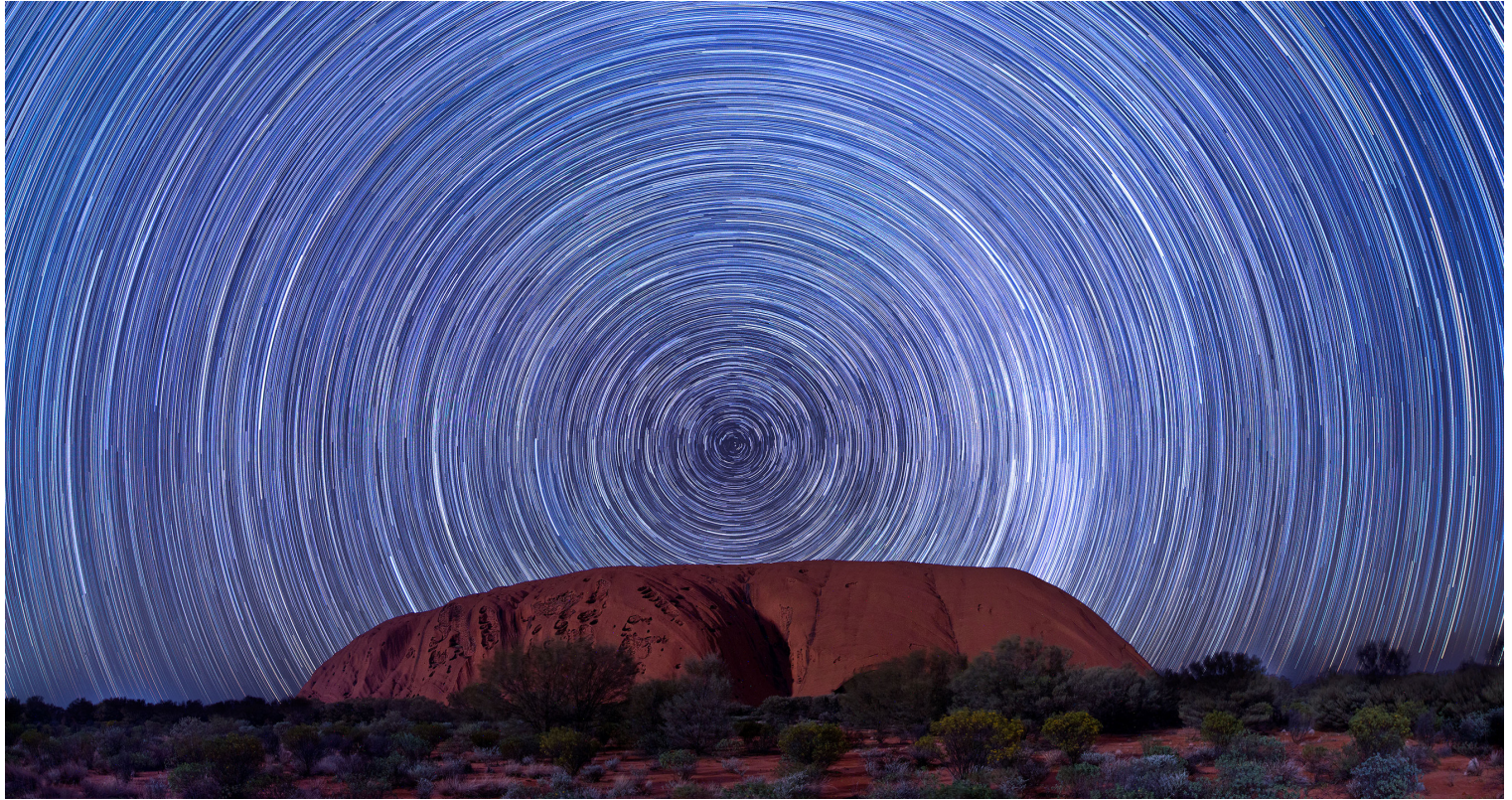
ROCK OF AGES